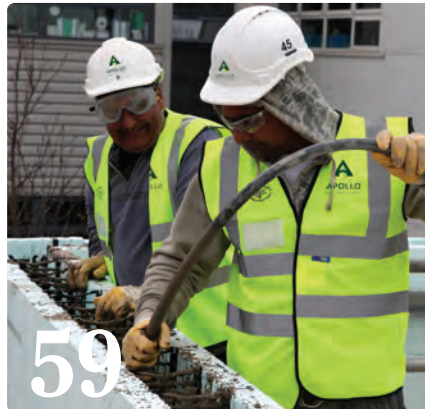
59 Woodside High School, London