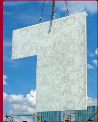
Five-star photo concrete, Germany

A nine-page review of innovative concrete projects worldwide starts on page 61