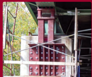
4th Street Bridge Project, Pennsylvania, USA