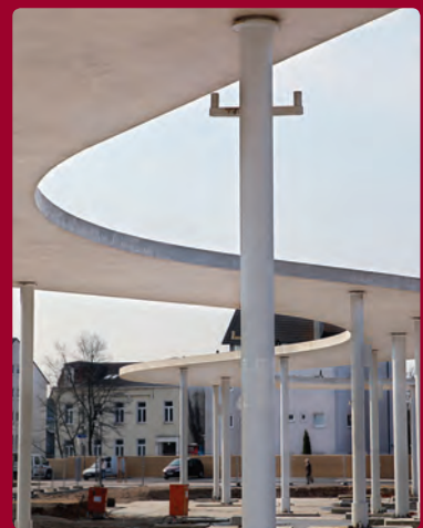
Merseburg bus terminal, Germany