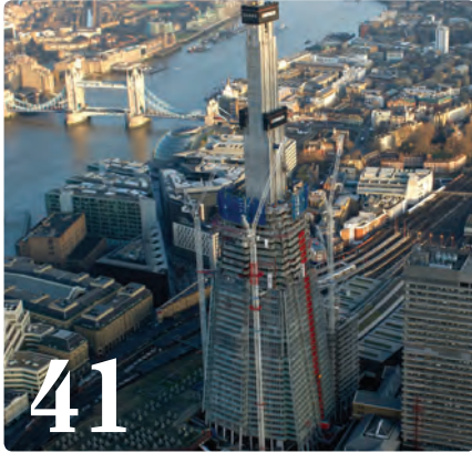
41 Developments in post-tensioning