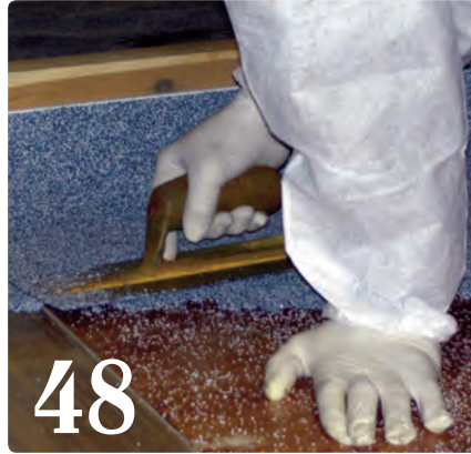
48 Training in the specialist sector