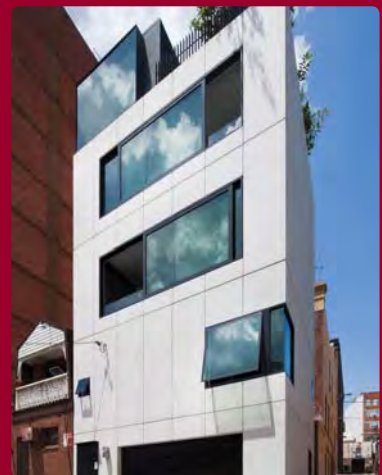
Grand design for Small House