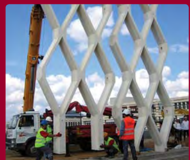
Structural engineering through prefabrication