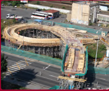
Bílina pedestrian bridge, Czech Republic 38