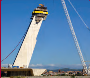
Bridge suspension tower erected in record time 32