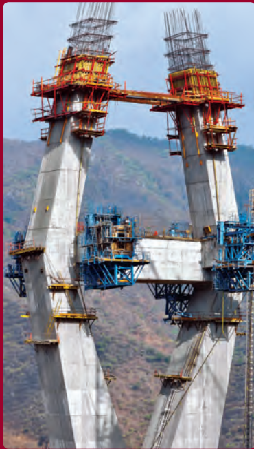
Puente Baluarte, Mexico 24